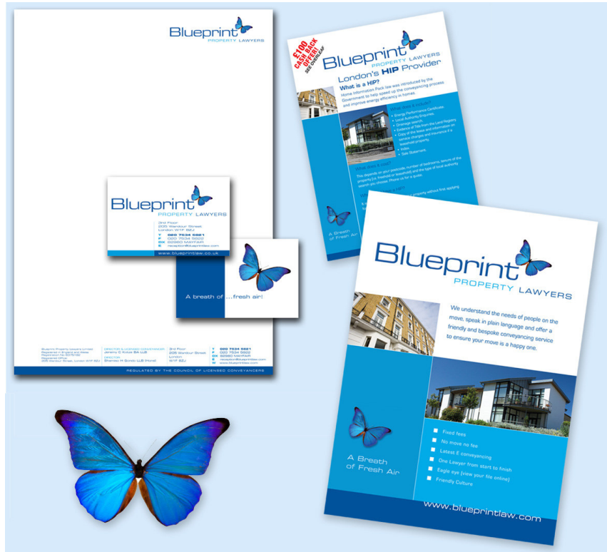
Figure 2 - Sample of Print Designs