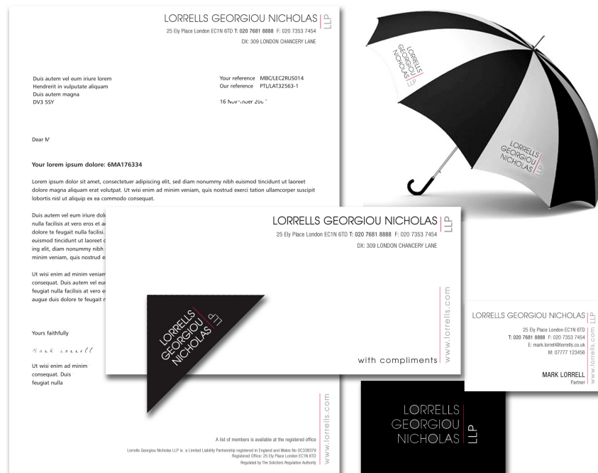
Figure 1 - Sample of Print Designs